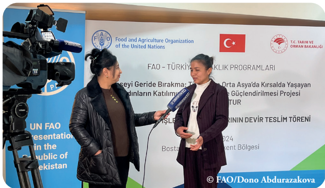
Training in dairy production, May 2024, Uzbekistan