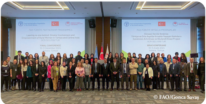
Final conference, December 2024 – Ankara

• Promoting regional dialogue and knowledge sharing