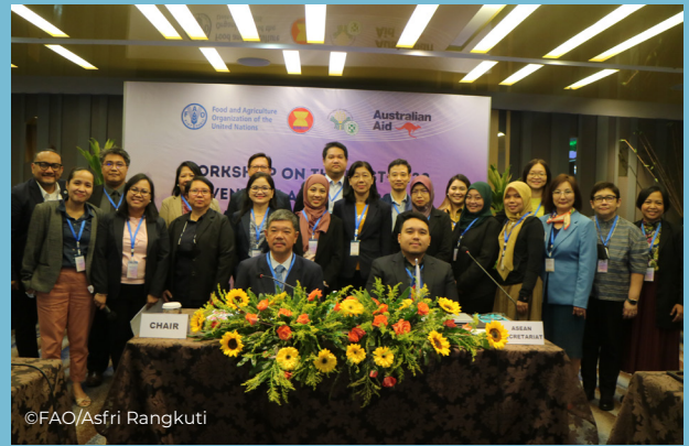
Figure 1. Workshop for the ASEAN Post-2020 Framework on Avian Influenza Control in ASEAN.

As part of the core group coordinated by the World Organisation of Animal Health (WOAH) and consisting of ASEAN RSU, ASEC, and ASEAN lead countries, FAO, through the SMART ASEAN project, provided input to the revision of the ASEAN Rabies Elimination Strategy (ARES) , the revision of the ASEAN ASF Control Strategy and the TOR for the ASEAN ASF Task Force, and supported the PPR Guideline's development.