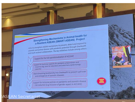
Figure 2. Multisectoral Consultative Meeting of the ASEAN Leaders' Declarations on One Health on March 15–17, 2023, in Bali, Indonesia.

Emergency Centre for Transboundary Animal Diseases (ECTAD) Regional Office for Asia and the Pacific RAP-ECTAD-Manager@fao.org www.fao.org/in-action/ectad X (Twitter) @FAOAsiaPacific