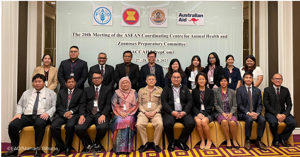
Figure 3. The 20th ACCAHZ PrepCom Meeting

Conduct another in-person quarterly coordination meeting between FAO, ASEAN Secretariat and DFAT and continue the regular monthly discussions with DFAT and ASEAN Secretariat