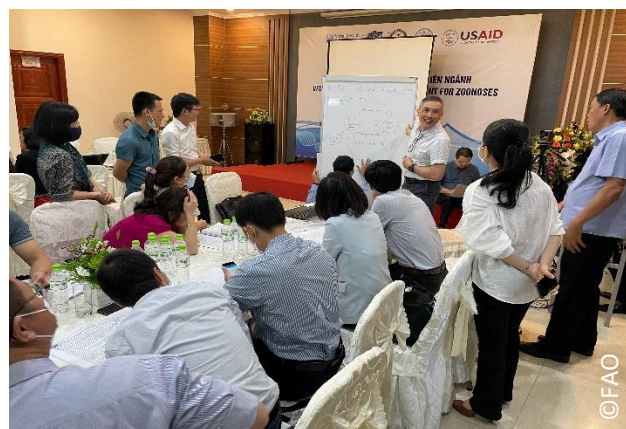
Joint Risk Assessment Workshop

Preventive Medicine (GDPM) of the Ministry of Health (MOH) – led by General Department of Preventive Medicine (GDPM) of MOH – has adapted the tool according to the institutional structure and legislation in Viet Nam.