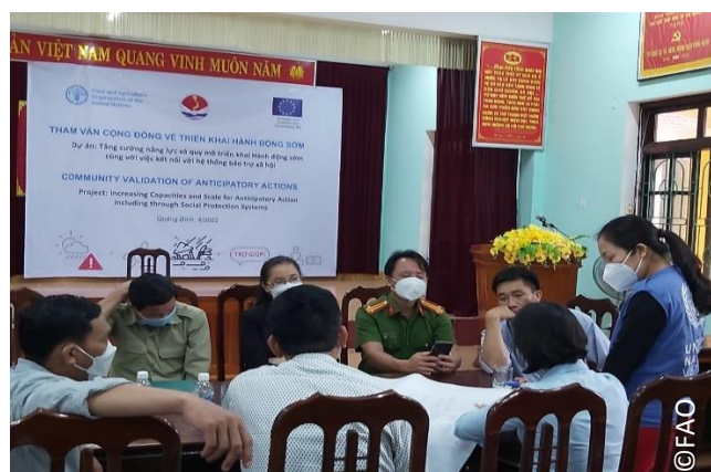
FAO Viet Nam team facilitates group discussions during the community validation of anticipatory actions

FAO in Viet Nam is working to enable vulnerable communities act early to mitigate the threat of intensifying climate change-driven natural disasters.