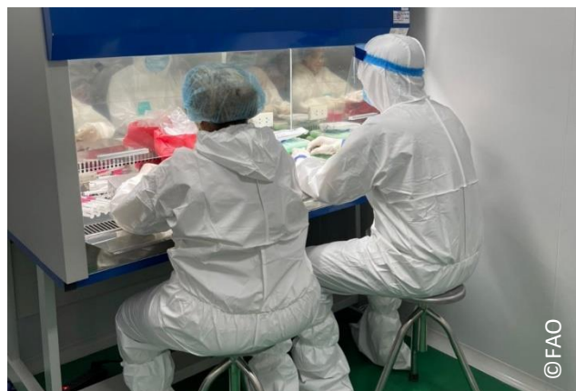
Destruction of the rinderpest virus in laboratory

FAO, with the World Organization of Animal Health (WOAH), has taken another step towards the planned destruction of the rinderpest virus in laboratories of Viet Nam. Despite the successful eradication of the disease from the natural host and wildlife in 2011, several laboratories around the world retain virus stocks including wild-type virus, vaccine seed strains, and manufactured vaccines.