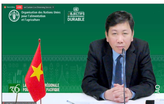
A Vietnamese delegation participated at the APRC 36

FAO, in partnership with the Ministry of Agriculture and Rural Development (MARD), has used the regional APRC 36 platform to outline the key responses to meet national food and agriculture challenges and promote regional coherence. This biannual meeting of all FAO member states in the Asia and the Pacific region, hosted by Dhaka, Bangladesh from 8 to 11 March 2022, offered an opportunity for government ministers, delegates and FAO representatives from more than 40 nations to debate key food and agriculture challenges and provide guidance to FAO's Global Conference in Rome in June next year.