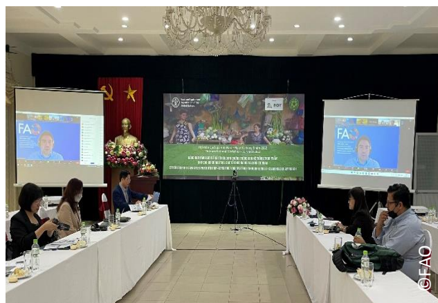
National workshop to review the achievement of the project

Realizing nutrition-sensitive food systems in Viet Nam is a step closer thanks to a FAO-driven project during the past five years.