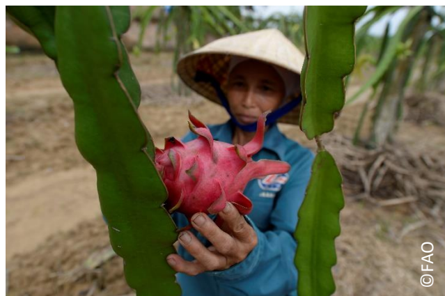
Dragon fruit plantation in the Mekong Delta

The mission, jointly conducted by the Ministry of Agriculture and Rural Development, particularly focused on how the project dovetailed with key strategic priorities of the provinces and methods of project implementation.