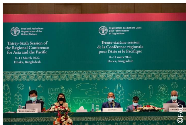
APRC 36 was held in Dhaka, Bangladesh

value chains and enhance the collaboration and information sharing in sustainable management of natural and water resources.