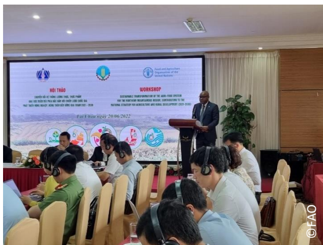
FAO Representative participated in the workshop to introduce the new National Strategy for Agriculture and Rural Development

FAO Viet Nam has played a key role in development of the National Strategy for Sustainable Agriculture and Rural Development in 2021-2030 with a vision to 2050, which will shape agricultural policy for the next decade. The strategy, recently approved by the prime minister, will kick-start the agriculture sector's transition to fully unlocking its economic potential.