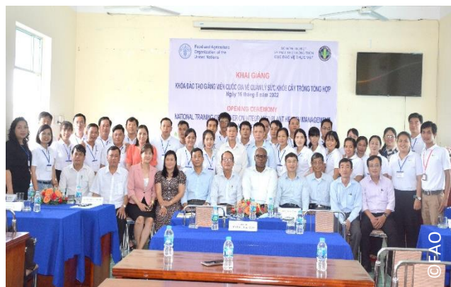
Opening ceremony of national ToTs on IPHM

Moreover, it will address integration of plant health, plant nutrition, food safety, quality and nutrition integration of social protection and inclusive growth in compliance with environment protection, ecosystem and biodiversity conservation. Together, this will increase the competitiveness of Vietnamese agriculture in domestic and global markets.