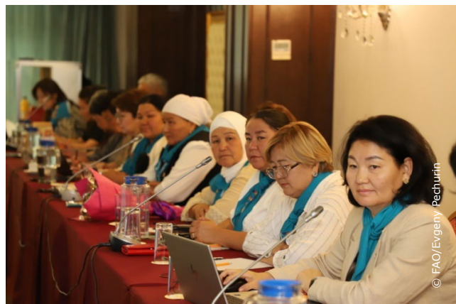
Delegates at the “Women in Agrifood Systems: Roles, Challenges, and Prospects” conference in Bishkek, 28 July 2025.