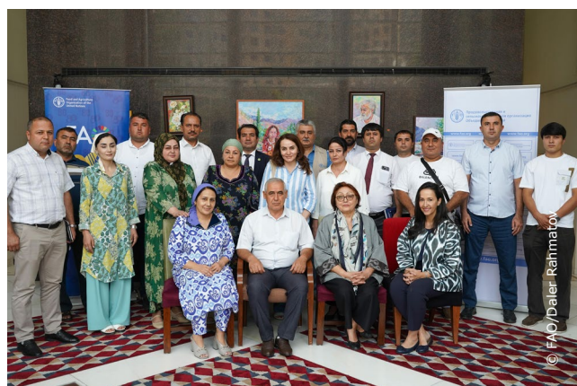
Participants of the workshop on gender-transformative approaches in the fisheries and aquaculture sectors in Dushanbe.

Women across Central Asia and the Caucasus play a critical role in fisheries and aquaculture value chains. Typically, they are involved in pre- and post-harvest activities, such as net mending, fish processing, marketing and trade, while men take on fishing roles, particularly in coastal and deep-sea waters. Women's involvement often lacks formal recognition, despite being central to household and community food security. Fishing itself is traditionally considered a male occupation, often involving higher occupational risks.