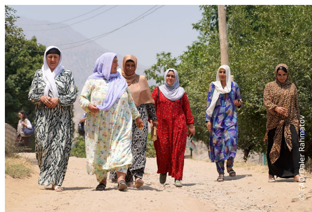
In Tajikistan, women are the backbone of agriculture and food security, yet their vital contributions often go unrecognized and underpaid.

In June 2025, the FAO regional gender team carried out a mission to Tajikistan to strengthen gender equality efforts across programming and policy support. The visit combined capacity building for the FAO Country Office, a national-level technical workshop, and field engagement with rural women beneficiaries.