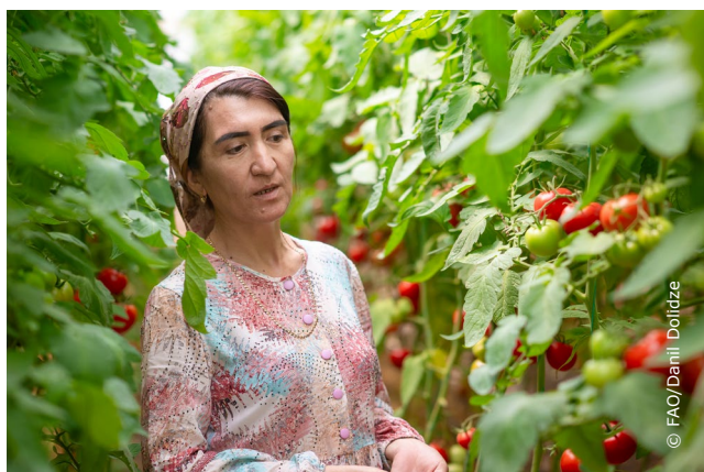
The launch event reaffirmed FAO’s role as a strategic partner in promoting gender-responsive agricultural reform in Uzbekistan.

More than 150 stakeholders gathered in Tashkent on 27 June 2025 for a High-Level National Dialogue marking the official launch of Uzbekistan’s Gender Strategy for Agriculture 2025–2030. The event, organized by the Ministry of Agriculture with technical support from FAO, was a milestone in placing gender equality at the core of agricultural and rural development policy.