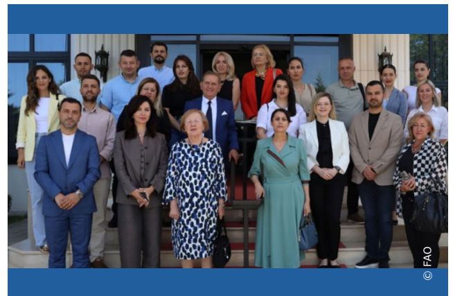
The third in a series of workshops with notaries was held in Prishtinë/Priština on 14 June 2025.

Three workshops held in 2025 on 24 May, 31 May and 14 June were organized by a project promoting rural women's empowerment that is jointly implemented by FAO and UN Women, with financial support from the Austrian Development Agency (ADA), and in close collaboration with the Notary Chamber of Kosovo.