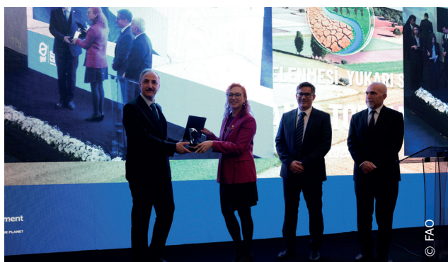
The LDN project is a source for new projects.

Degradation Neutrality” approach at the national level, particularly in the Upper Sakarya Basin, has proven that it is possible to create a development model in harmony with nature.