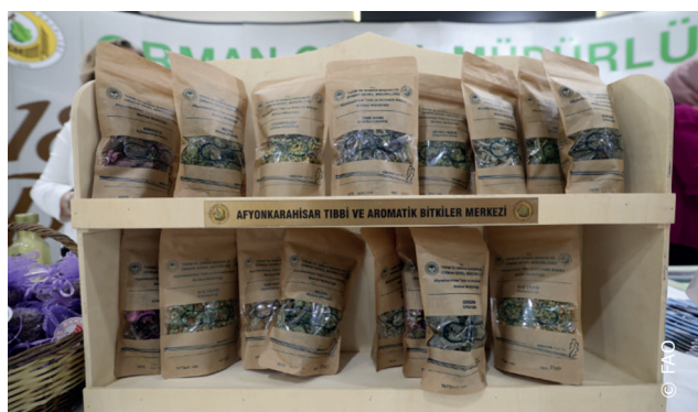
Products of the Afyonkarahisar Medicinal and Aromatic Plants Centre.