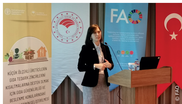
Project inception workshop held in Ankara.

While ensuring food safety, the project aims to preserve traditional production methods, promote a "safe food culture" and enhance knowledge of healthy nutrition. Additionally, it proposes a series of actions to strengthen the capacity of the Ministry of Agriculture and Forestry and to support small-scale producers in shortening their food supply chains.