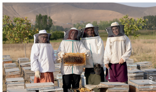
The Ahtamara Women's Cooperative in Van receiving material support from FAO.

Such projects can strengthen the success of cooperatives in the long run and enable the proper management of natural resources.