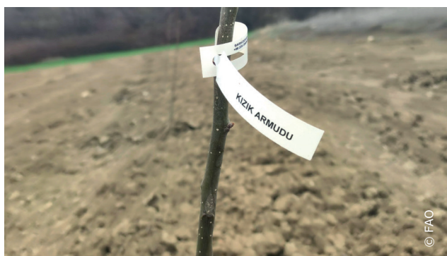
Project inception workshop held in Ankara.

The Kızık Pear saplings, which have taken root in Seben's fertile soil, will continue to bear fruit over the years, preserving the region's agricultural heritage.