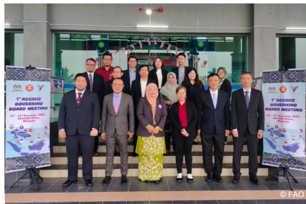
Figure 1. The First ACCAHZ Governing Board Meeting in Malaysia

6. During the 1st ACCAHZ GB meeting, the following documents developed by ASEAN RSU during the last reporting period, were discussed and approved by the 1st ACCAHZ GB Meeting: