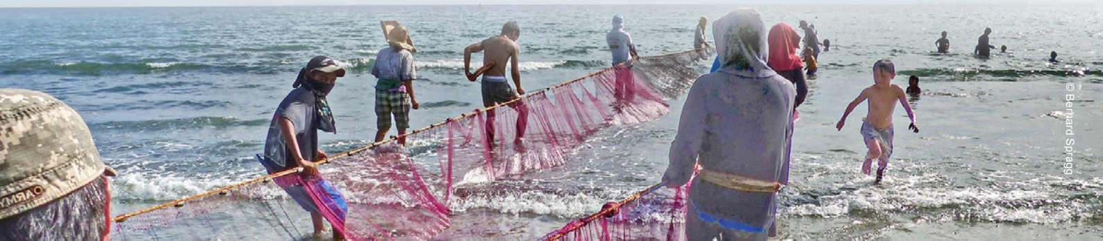
Fisherfolk pulling in their nets in Currimao, Philippines

Only four DAEs have been accredited in the six countries participating in the Agriculture Sector Readiness for enhanced climate finance and implementation of Koronivia Joint Work on Agriculture priorities in Southeast Asia project (Southeast Asia GCF Readiness project).