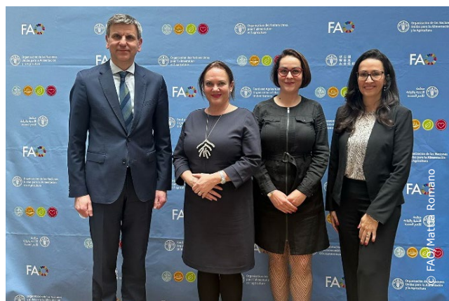
FAO and UHW representatives meet to strengthen collaboration on gender equality and rural women's empowerment.

between FAO and UHW, a key advocate for gender equality across Central Europe.