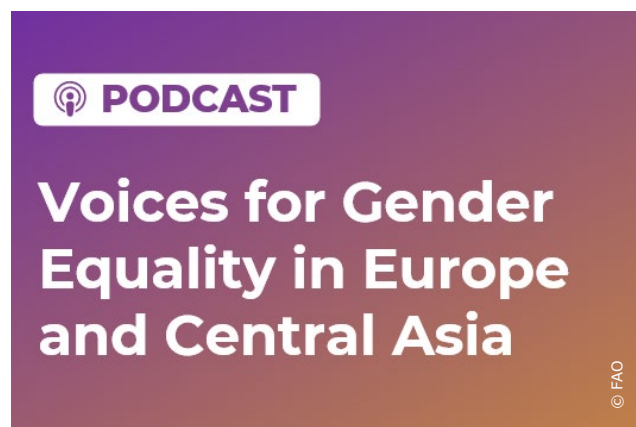
The podcast "Voices for Gender Equality" explores FAO's work to empower rural women across Europe and Central Asia.

Through engaging conversations with experts and voices from the field, the podcast serves as a platform to exchange experiences and good practices to inform more inclusive and effective development work.