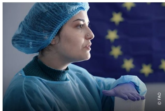
Georgian women are accessing grants to upgrade equipment and premises for improved food safety standards.

To mark International Women's Day, representatives from FAO, the European Union Delegation and Sweden joined local women dairy farmers in Tsalka, Georgia, for a hands-on celebration of progress in rural women's empowerment. The event featured a model cheese-making session and showcased practical elements of FAO's food safety training for small-scale dairy producers.