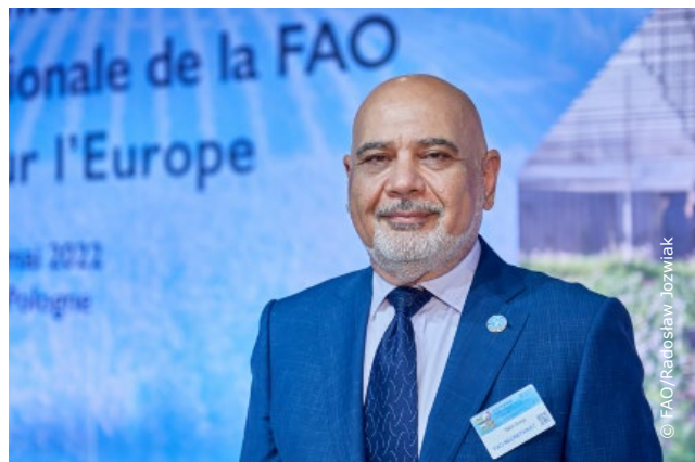
Nabil Gangi, FAO Deputy Regional Representative for Europe and Central Asia.

play in shaping agrifood systems. In an interview for the event, Nabil Gangi, FAO Deputy Regional Representative for Europe and Central Asia, highlighted how empowering women is central to building agrifood systems that are efficient, sustainable, resilient – and inclusive, ensuring that no one is left behind.