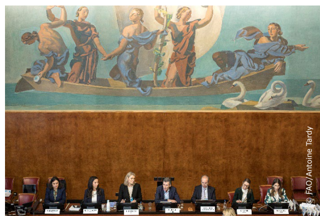
Panellists at “Re-imagining the future of women in food systems,” Palais des Nations, Geneva.

On 3 April 2025, FAO led the side event “Re-imagining the future of women in food systems: harnessing science, technology and partnership to advance the SDGs”, co-organized with the United Nations Food Systems Coordination Hub, UNECE and other partners. As global progress towards gender equality slows, the session explored how innovation, inclusive policymaking and access to technology can help dismantle structural barriers for women in agrifood systems.